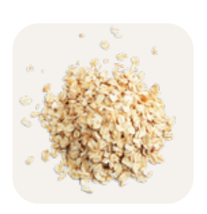
Extruded Products & Breakfast Cereals