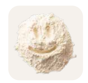
Flours & Bakery Mixes