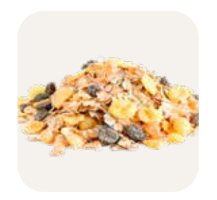
Porridges & Mueslis