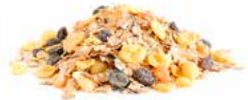
Porridges & Mueslis