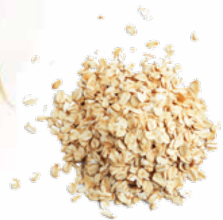
Extruded Products & Breakfast Cereals