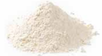
Flours & Bakery Mixes